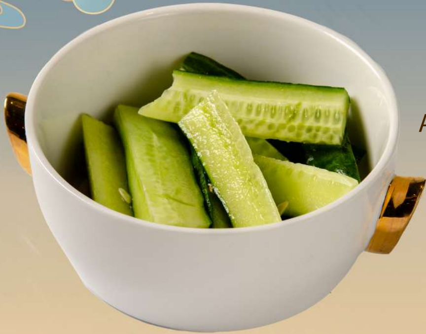
A5 南莊醋蜜黃瓜 Nanzhuang Cucumber with Vinegar and Honey RM7.9